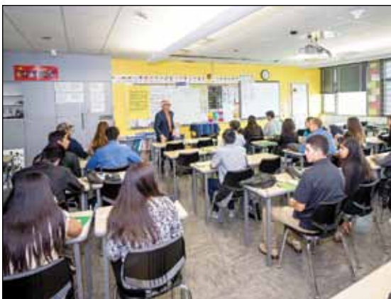
Left: Speaker addresses students at the one of the workshops at the 2016 Pathways to Employment event.