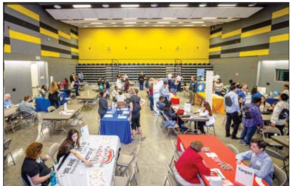
Right: Company representatives talk to students at last year's Pathways to Employment event. Registration for this year is now open at nwsanpedro.org .

Plans are underway for the sixth annual Pathways to Employment event hosted by the Northwest San Pedro Neighborhood Council. This event is designed to assist Harbor Area youth with the skills they need to apply for jobs, get hired, and successfully navigate every day work life.