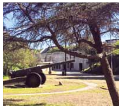
Fort MacArthur Museum Battery Osgood-Farley

They are open to the public every Saturday from 10:00 a.m. to 4:00 p.m. and the admission is FREE.