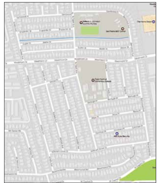
Taper Elementary Neighborhood Watch area